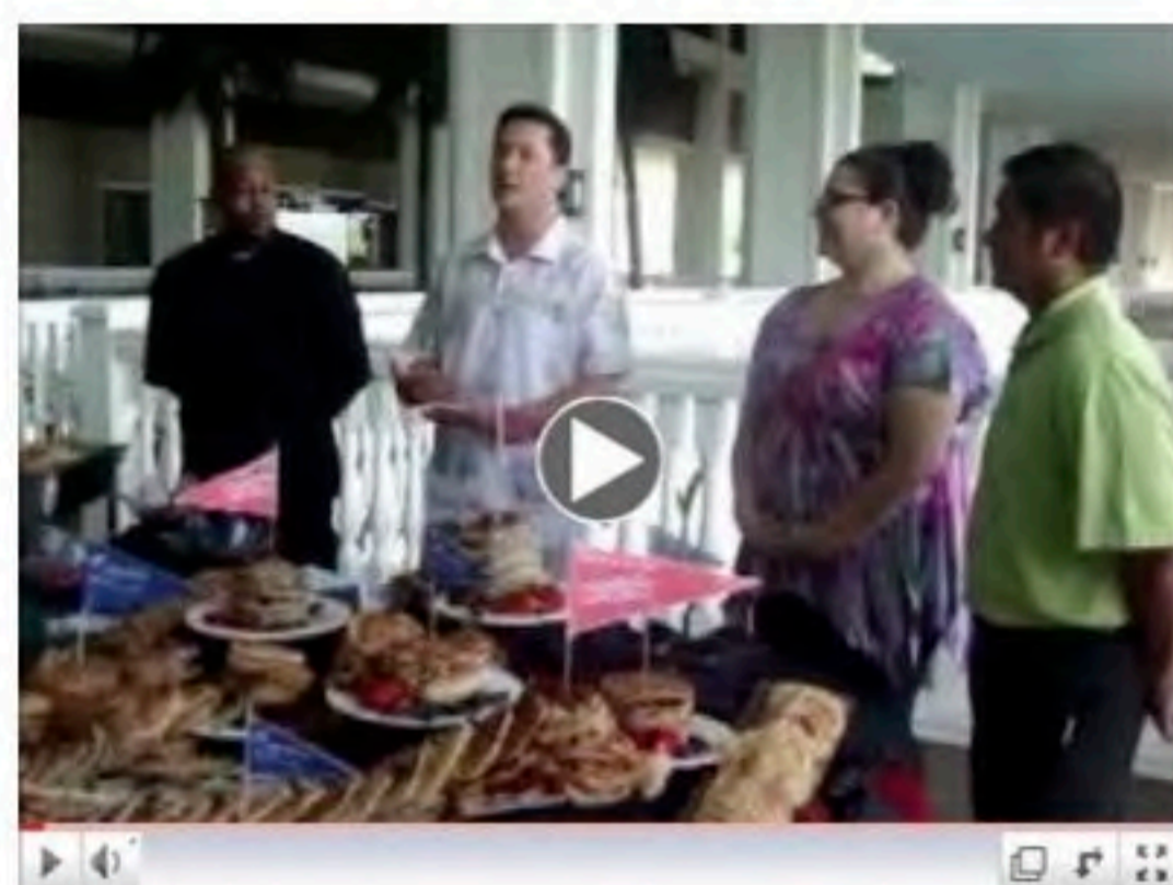
Pancakes for Charity 2012 - Announcement

To learn more about Pancakes For Charity, watch the video of our announcement below, and visit our Facebook Page for more photos and videos.