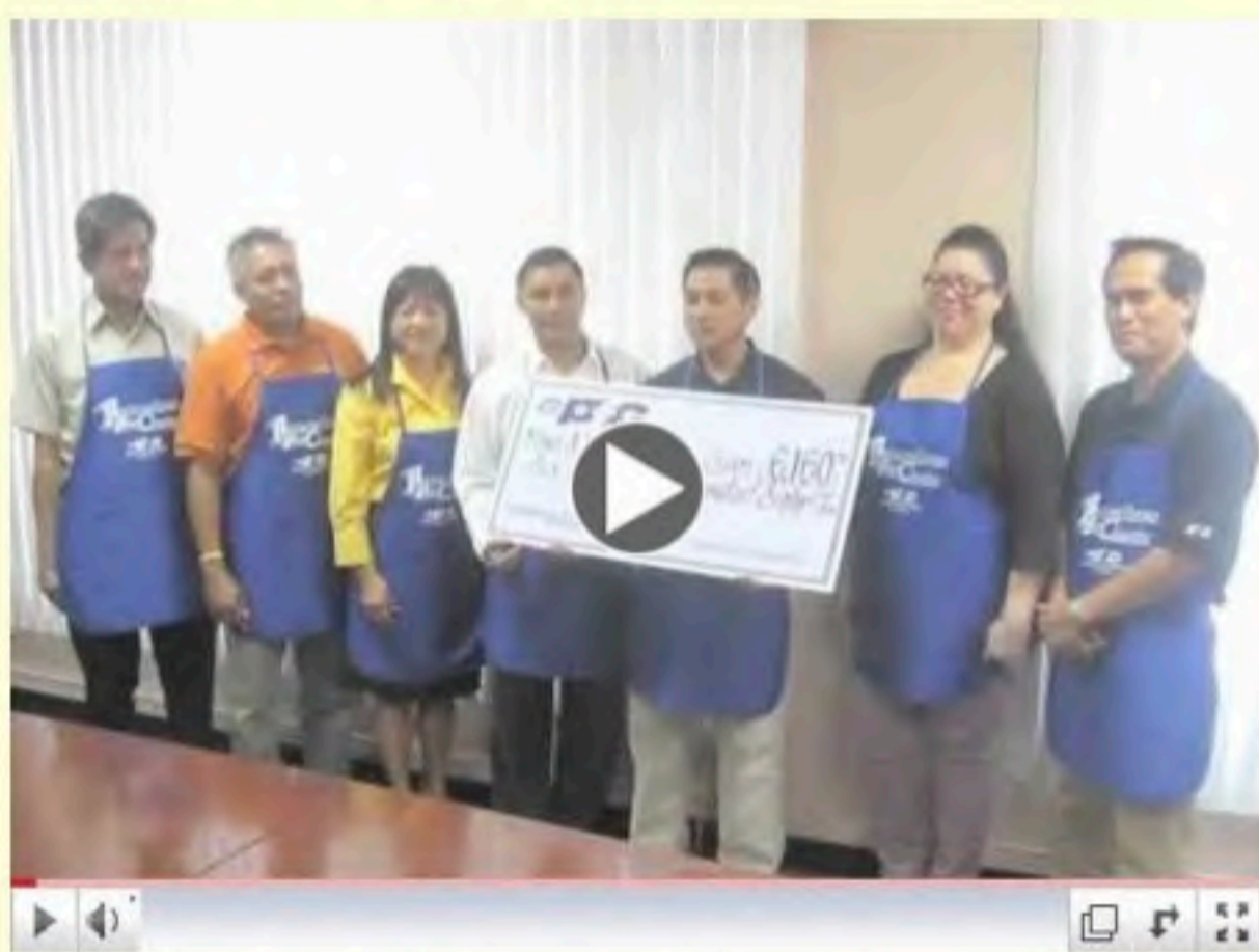
Pancakes for Charity - Check Presentation 2012

We would like to thank all of our guests at Pancakes for Charity, as well as everyone who worked hard to make this event a success. Your contributions will support children from Guam and the Northern Marianas with life-threatening medical conditions, as well as the local arts. We believe in community service at Personal Finance Center, and we were thrilled that you could join us in giving back to the island community. We look forward to seeing you next year!