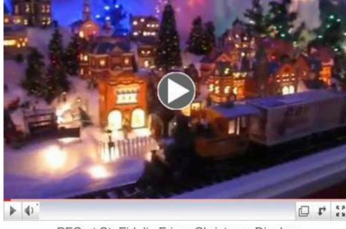
PFC at St. Fidelis Friary Christmas Display

The display this year, "Manger in the City," boasts a spectacular from 6 p.m. to 9 p.m. until January 8, 2012, and there's no better way on Guam to get into the Christmas spirit. See you there!