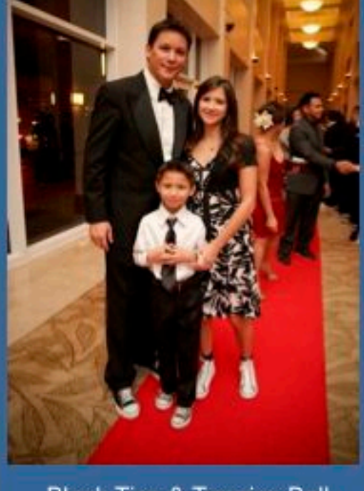
Black Ties & Tennes Ball Make-A-Wish Foundation