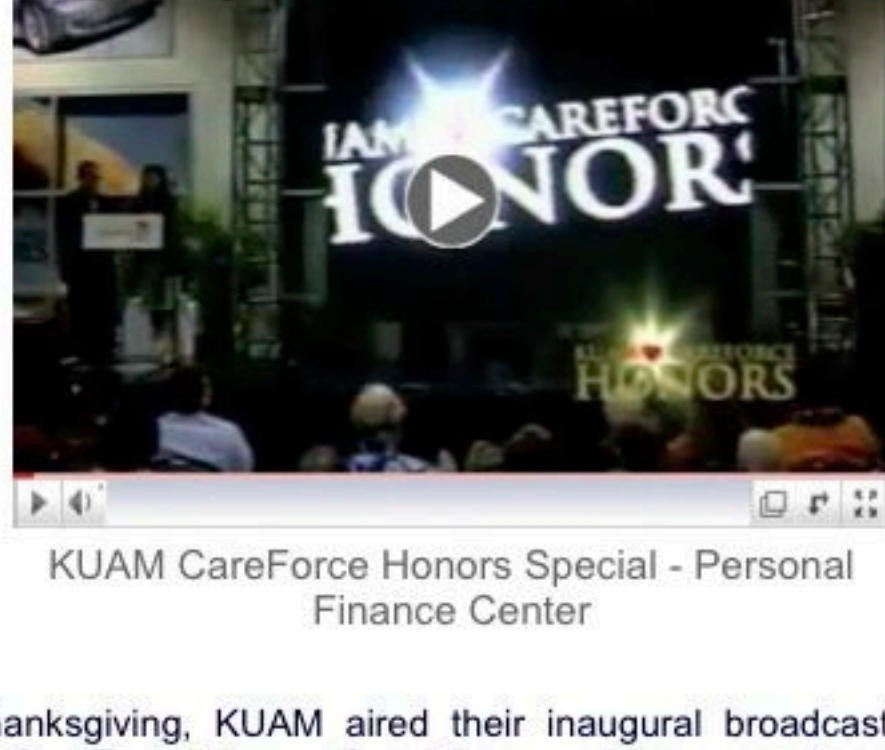
KUAM CareForce Honors Special - Personal Finance Center

On Thanksgiving, KUAM aired their inaugural broadcast of the KUAM CareForce Honors Special, recognizing several community partners and individuals for their service to the island's community. At PFC, we were very proud to be among those acknowledged on Thursday night.