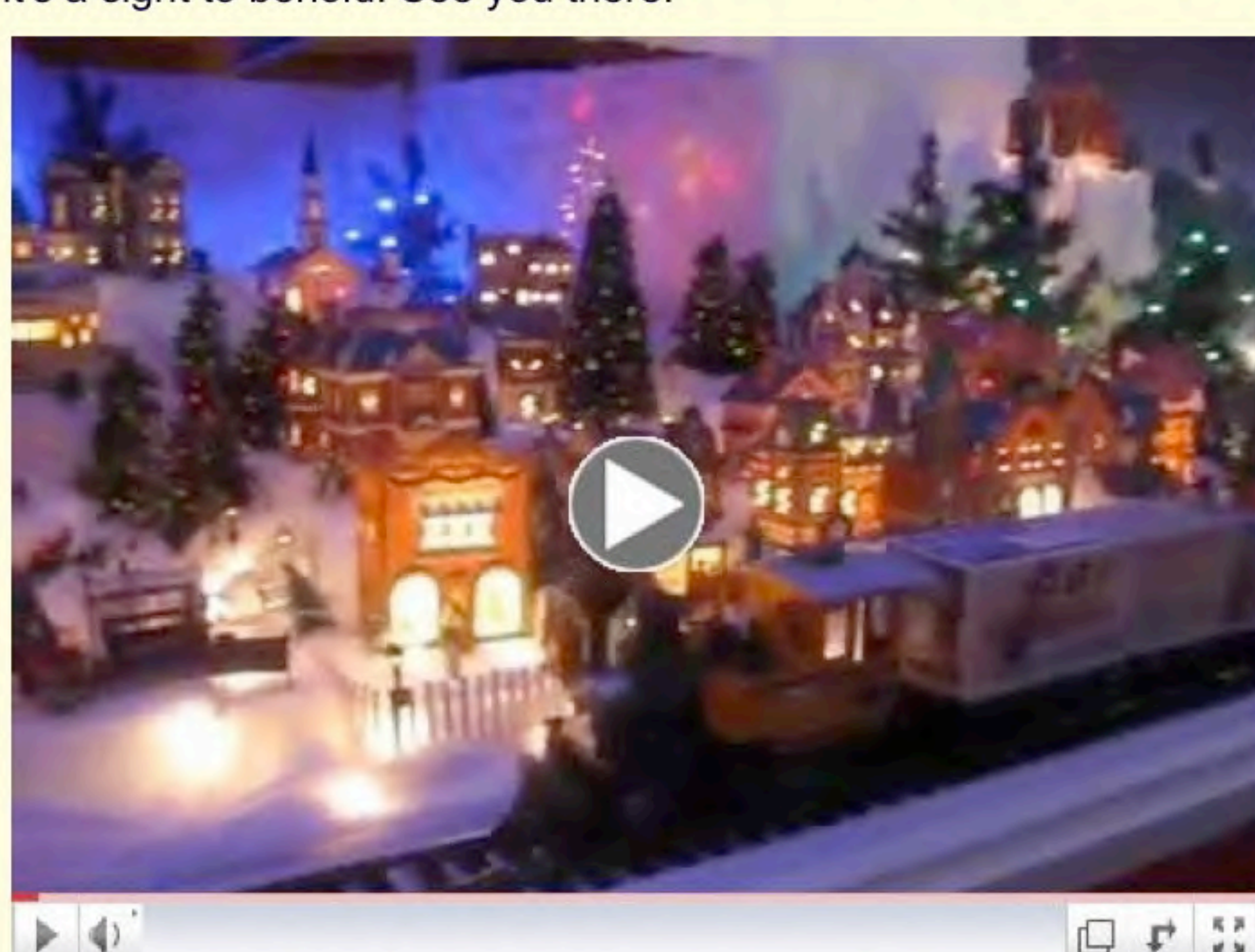
PFC at St. Fidelis Friary Christmas Display

The miniature Christmas village will be on display at the Friary until Sunday, January 8, 2012. You can watch our video below for a quick preview, and stop by the Friary to see the display in person from 6 p.m. to 9 p.m. every night until January 8th. As you can see, it's a sight to behold. See you there!